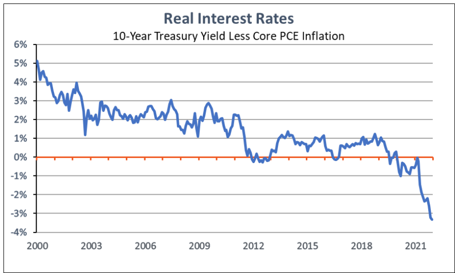
Chart 1: Real Interest Rates in the U.S., June 2000–December 2021

in late 2021 and 2022. Real interest rates are nominal interest rates less the inflation rate. Chart 1 shows the yield of the U.S. 10-year Treasury less inflation as measured by the Core Personal Consumption Expenditures (PCE) Index, which excludes food and energy categories because they tend to be volatile. Real interest rates in the U.S. dipped to -3.3% as of December 2021.