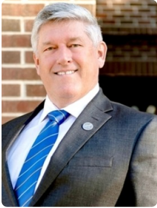
Troy Downing Commissioner of Securities and Insurance, Montana State Auditor Western Zone